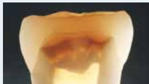
The same type of light distribution and appearance can be achieved with Vivaglass CEM: Reflect 02/2008, Ivoclar Vivadent AG, Dr. Andreas Kurbad.