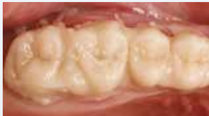
4 The crowns are seated.