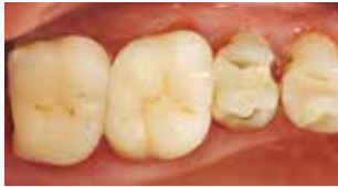
1 Pre-operative situation.