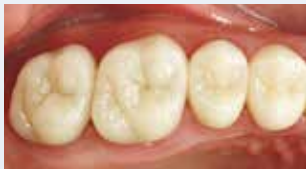
5 Post-operative situation.

Vivaglass CEM is easy to use: Simply mix the powder and the liquid in a 1:1 ratio and immediately seat the restoration.