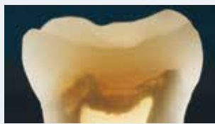
An all-ceramic crown bonded with the adhesive technique has a very natural-looking appearance.