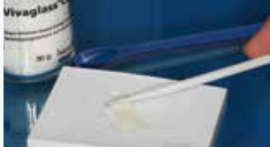
2 Vivaglass CEM is mixed.