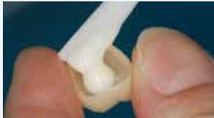
3 Vivaglass CEM is applied.