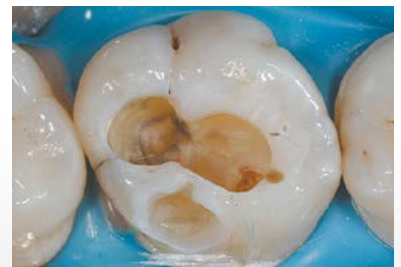
After it has been etched, rinsed and dried, the enamel has a chalky-white appearance, which aids the operator in checking the etching results.