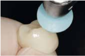
High-gloss polishing with OptraGloss®