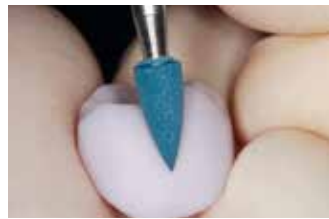
Polishing of the "blue" restoration, followed by speed crystallization for 15 minutes.