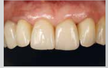
Recall in 2017

“ I’m impressed with IPS Empress CAD Multi because of its natural light scattering. The transition of shade and fluorescence maximizes the esthetic effect without the application of characterizations. Its durability has been confirmed in everyday clinical practice. ”