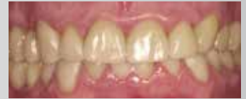
IPS e.max® CAD crowns and bridges: Recall after 7 years

“ Having used IPS e.max® CAD for ten years in clinical applications, I'm fascinated by the material's reliability, high esthetics and biocompatibility. The high number of bridges that we have successfully created at chairside is an indication of the new dimensions that this material opens up for patients and operators. ”