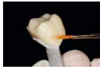
Glazing with fluorescent IPS e.max® CAD Crystall./Glaze Paste Fluo