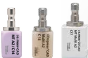
IPS e.max® CAD, IPS Empress® CAD. IPS e.max® ZirCAD