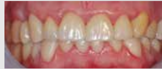
Final situation in 2009