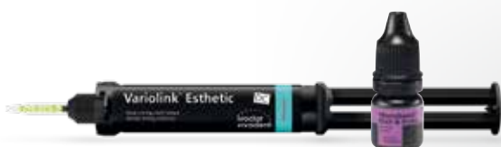
Monobond Etch & Prime®, Variolink® Esthetic