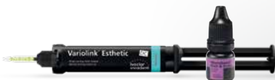
Monobond Etch & Prime®, Variolink® Esthetic