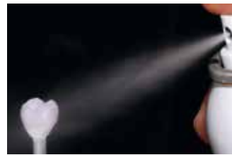
Glazing of the "blue" restoration followed by speed crystallization for 15 minutes.