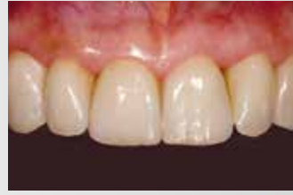
Final situation in 2007