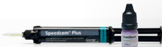
Ivoclean®, Speedcem® Plus