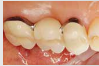
Starting situation: metal-ceramic bridge, palatal view

“ For me, IPS e.max ZirCAD zirconium oxide for chairside restorations ideally complements IPS e.max CAD for posterior bridges. ”