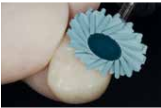
Quick high-gloss polishing in only one step (OptraGloss®)