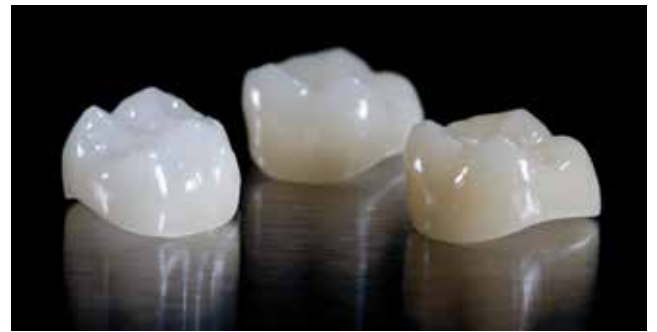
IPS Empress® CAD Multi reproduces the characteristics of the natural tooth. The level of chroma and fluorescence is elevated in the cervical portion and decreases towards the translucent incisal area.