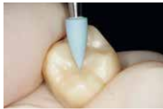
High-gloss polishing with OptraGloss®