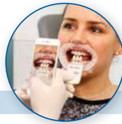
3. The DSA Holder is held up against the patient's teeth. 4. A digital photo is taken of the tooth and the shade samples.