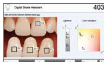
3. Manual analyses including brightness and shade saturation (lab values)