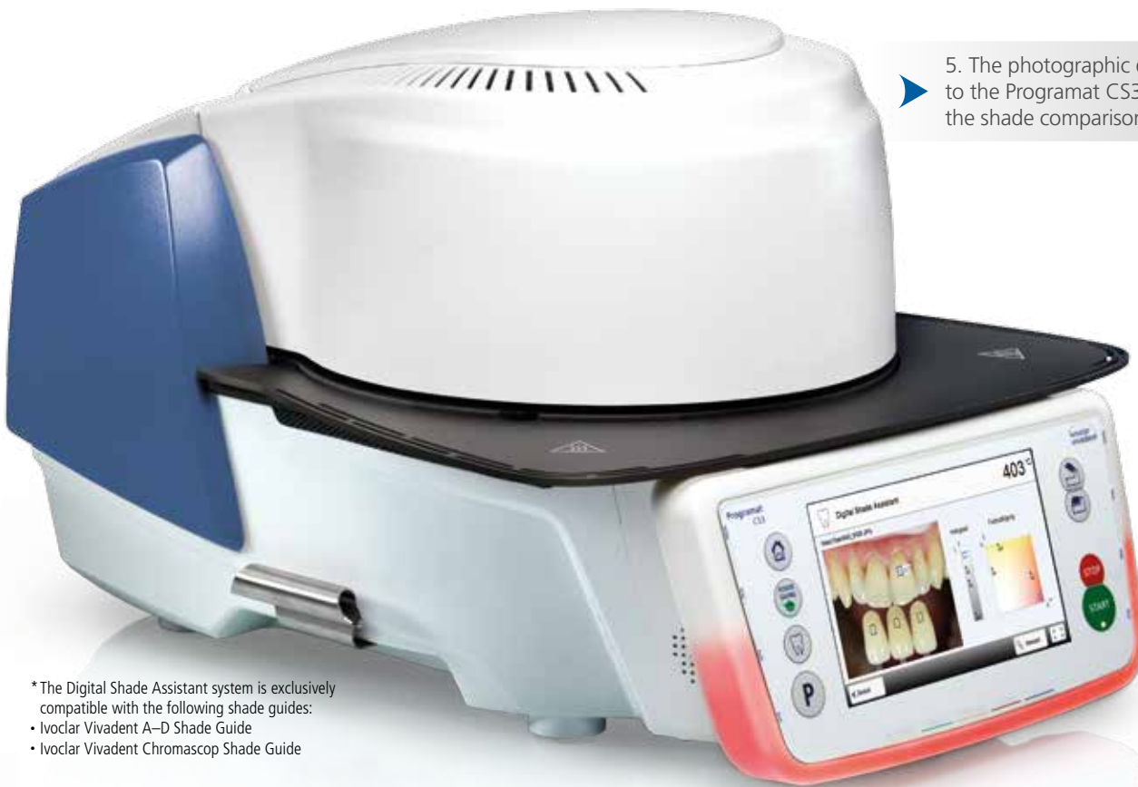
5. The photographic data is transferred to the Programat CS3 in order to carry out the shade comparison with the DSA function.

* The Digital Shade Assistant system is exclusively compatible with the following shade guides: • Ivoclar Vivadent A-D Shade Guide • Ivoclar Vivadent Chromascop Shade Guide