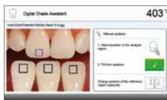
2. Either incisal edge to incisal edge or tooth neck to incisal edge can be selected.