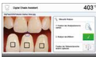
1. The area of reference can be individually selected.