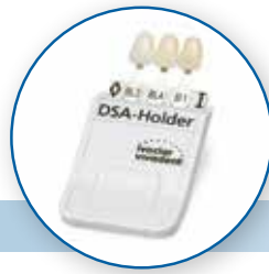
2. The reference shades are inserted into the Digital Shade Assistant Holder.