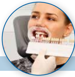
1. The three closest tooth shades* are selected.