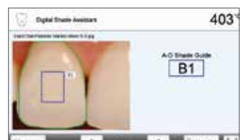
4. Zoom function for a detailed view