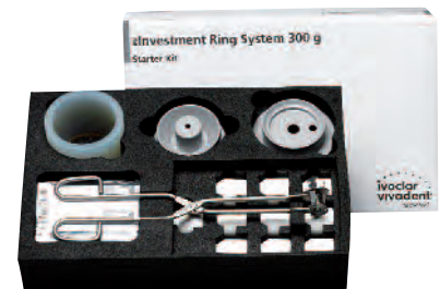
IPS Investment Ring System 300 g Starter Kit

Descriptions and data constitute no warranty of attributes. Printed in Switzerland © Ivoclar Vivadent AG, Schaan/Liechtenstein 616656/1108/e/RDV