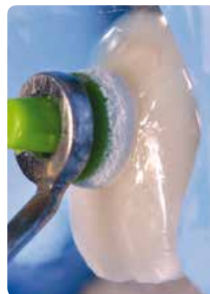
Cementation with Variolink® Esthetic Dr S. Kouji, France

The self-adhesive, self-curing resin cement SpeedCEM® Plus is particularly suitable for the cementation of zirconium oxide restorations.